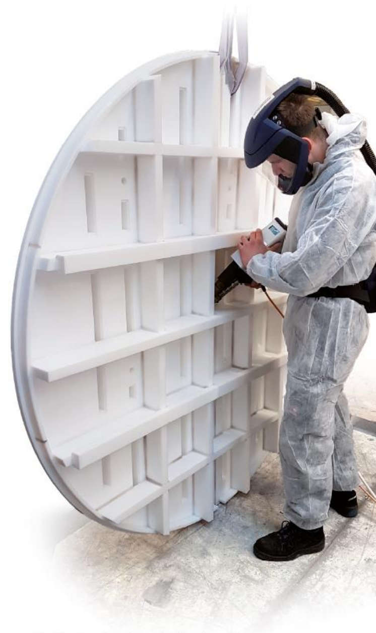
Mass transfer tray with welded rib design for stabilization. (Plate thickness: 30 mm)

The reduced molecular weight of PTFE-M makes this material weldable. Therefore, particular requirements are necessary. For example, the use of specific clamping devices and on the market available extruders, which are especially produced for PTFE-M, are crucial. Taking account of the current safety regulations, we produce the SKT products, which you are familiar with, in PTFE-M now. Specifically for the processing of fluorine plastics, we have an established production line.